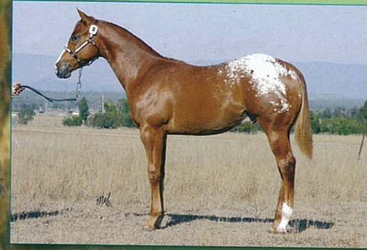
A young Tex at 6 months