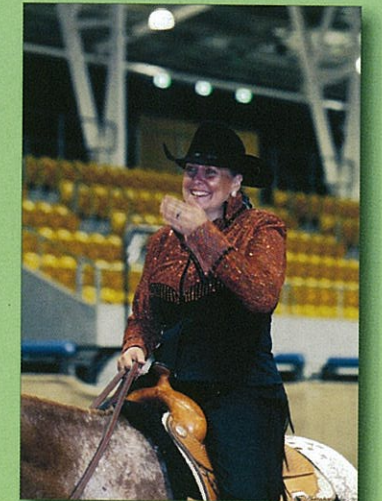
Overwhelmed after a big win at the 2010 Nationals