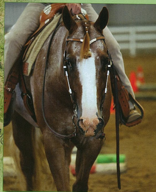
Always calm and relaxed